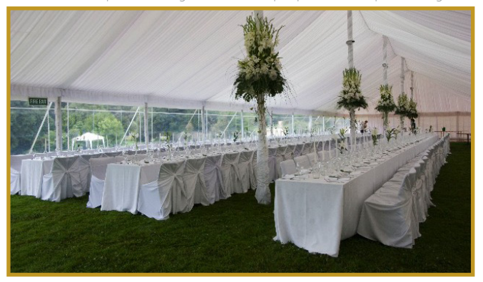
An interior example of seating well over 150 people with banquet seating

A layout map seating 200 people, this can be modified any way you choose